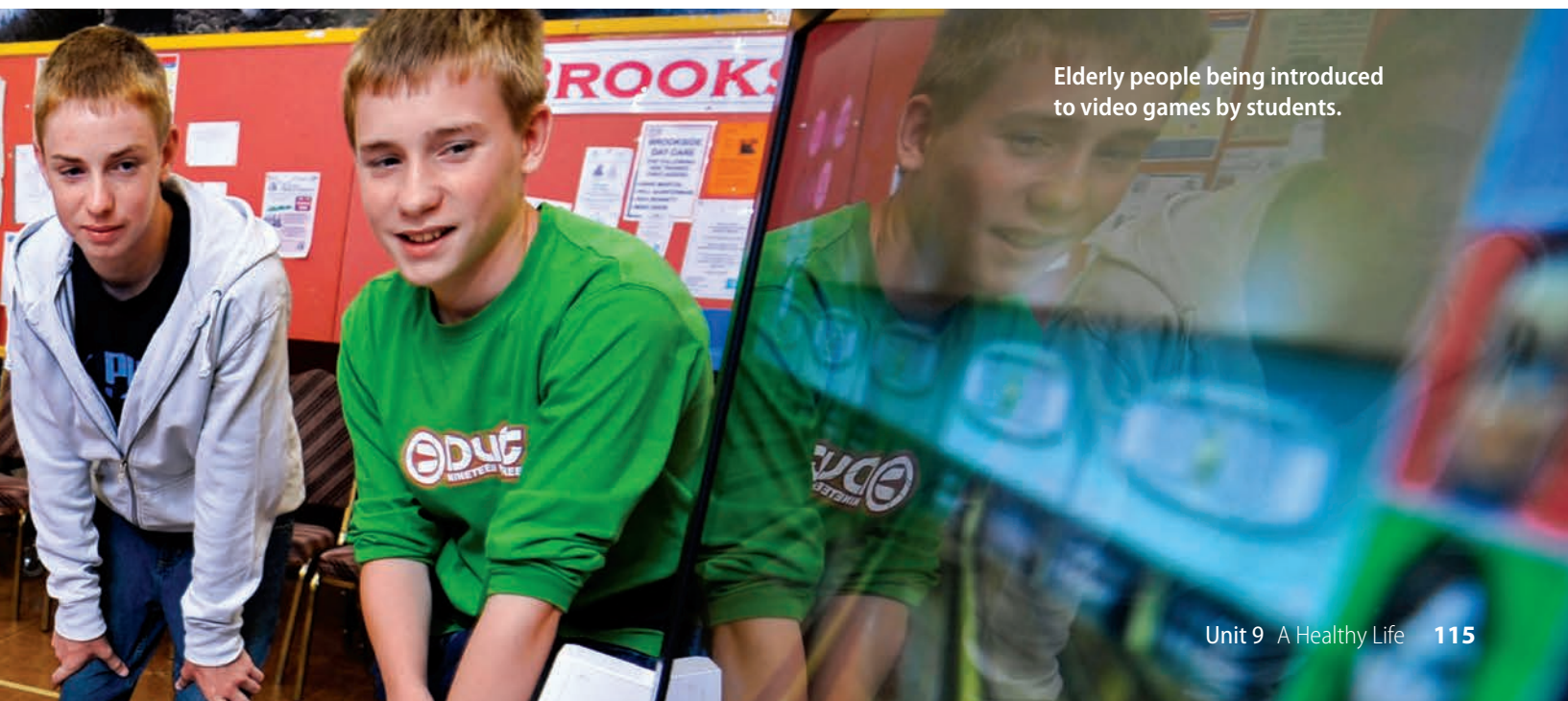
Elderly people being introduced to video games by students.

I wonder how feasible it would be to... ✓